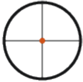
1st focal plane