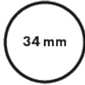
Main tube 34 mm