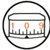
EasyRead elevation turret