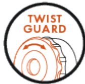
TWIST GUARD windage