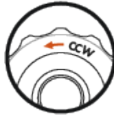
Adjustment direction CCW